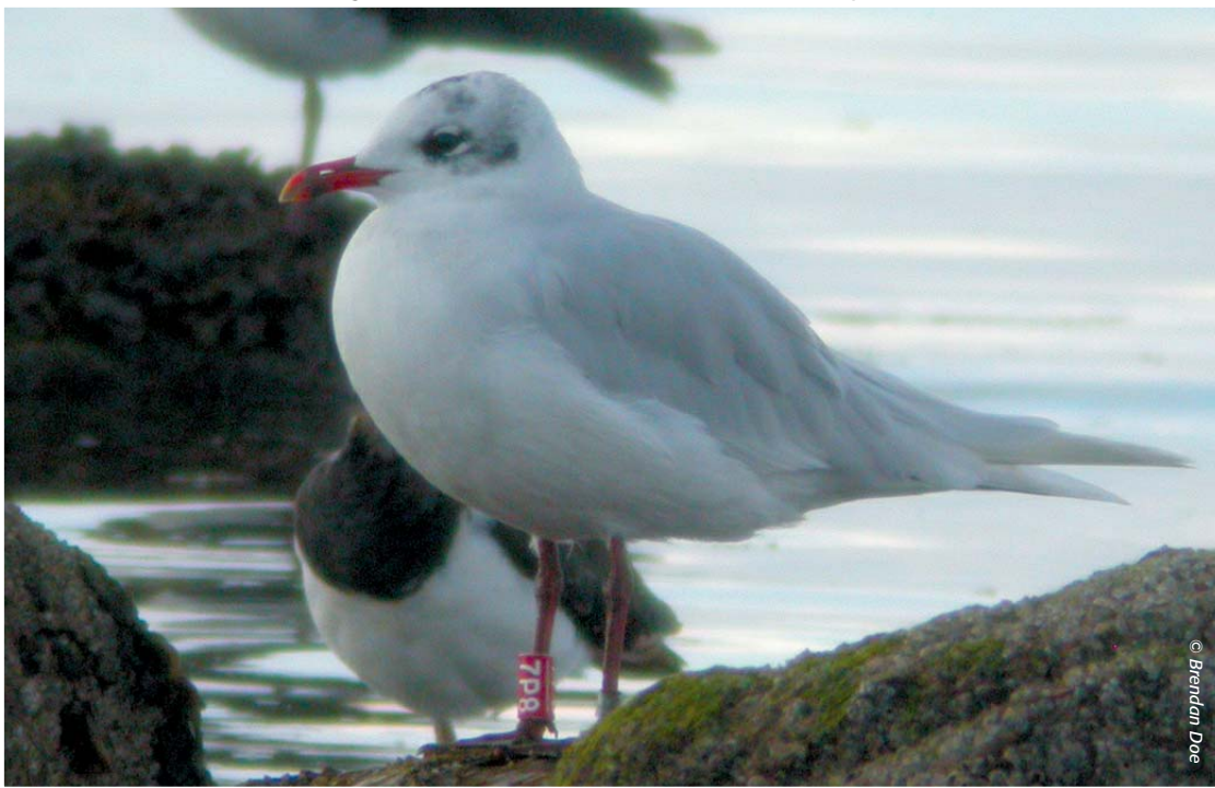
PLATE 58. Colour-ringed Mediterranean Gull FP8. Port Seton Burn, April 11, 2005.

The inquiry resulted in Scottish records of ten different Mediterranean Gulls. These birds were ringed in Belgium (5), the Netherlands (2), Poland (1), Hungary (1), and Norway (1). Seven of them were ringed as chicks (four Belgians, the two Dutch, and the Hungarian), and two were ringed as adults on the breeding site (the Polish one and the other Belgian). The Norwegian Mediterranean Gull was ringed as a first-winter bird.