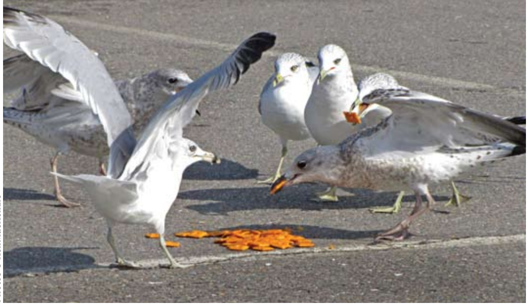
Gulls are adept at taking advantage of many food resources provided intentionally or unintentionally by people. Here a group of Ring-billed Gulls (including two juveniles) glom a handout of cheese crackers in a shopping mall parking lot. The provision of such artificial resources, however well intentioned, encourages the birds to remain and congregate on local waters when they would otherwise disperse.

including deer, turkey, and waterfowl. The capture method is extremely safe