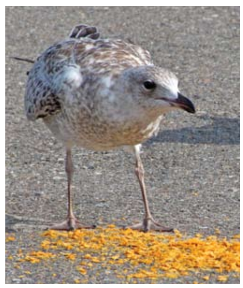
An immature Ring-bill has a mottled look and lacks the distinctive bill ring of an adult. Other species of gulls also roost on DCR reservoirs, but Ring-bills outnumber them by more than 4 to 1.

Gulls were captured with a self-contained net launcher, powered with a blank .308 charge. Various kinds of these "rocket nets" are routinely used in wildlife studies to capture a variety of animals,