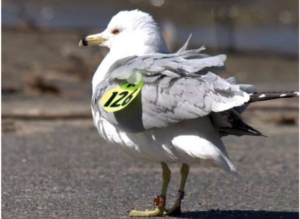
Vinyl wing or "patagial" tags allow observers to identify individual marked birds even when their leg bands (in shadow here) are hidden by water or vegetation.

To the surprise of DCR, the number of reported wing-tag sightings has been remarkable. As of February 2011, folks have reported seeing 661 individual Ring-billed Gulls for a total of 3,077 sightings. These sightings have covered an extensive geographic area ranging from Canada to Florida (see facing page). In