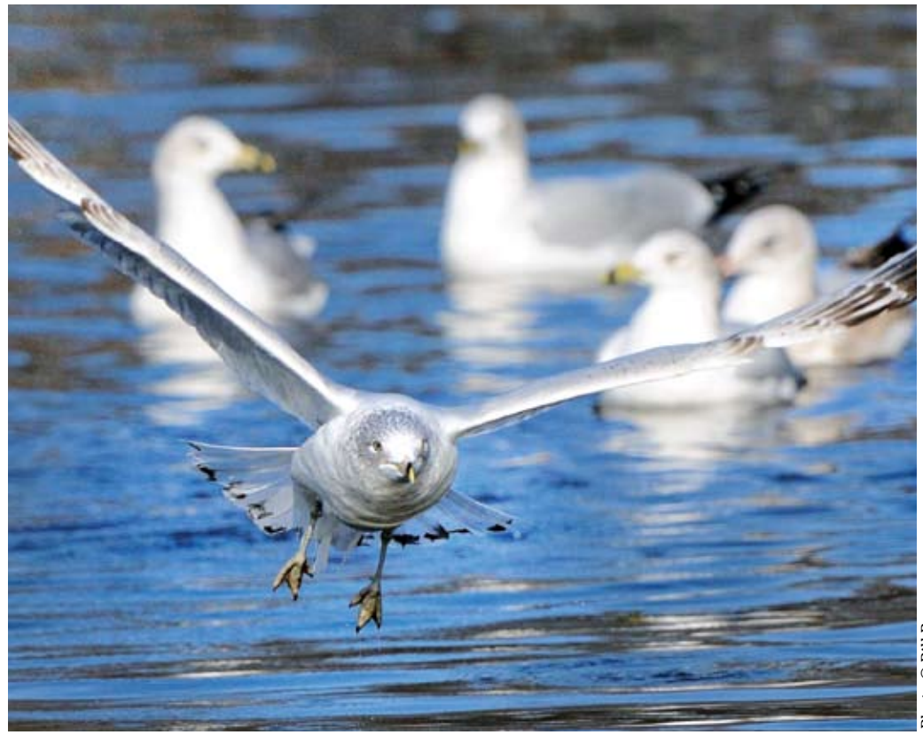
The DCR study revealed that Ring-billed Gulls make up approximately 75% of the birds that roost on Wachusett Reservoir. When thousands congregate on the water, their impact on water quality can be substantial. 10