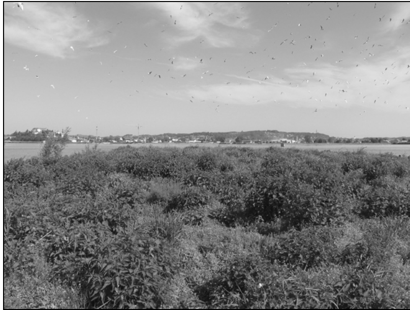
Fig. 2: Breeding habitat of the Mediterranean Gull Larus melanocephalus at Lake Ptuj, 23 rd May 2006.

Sl. 2: Gnezditveni habitat črnoglavega galeba Larus melanocephalus na Ptujskem jezeru, 23. 5. 2006.