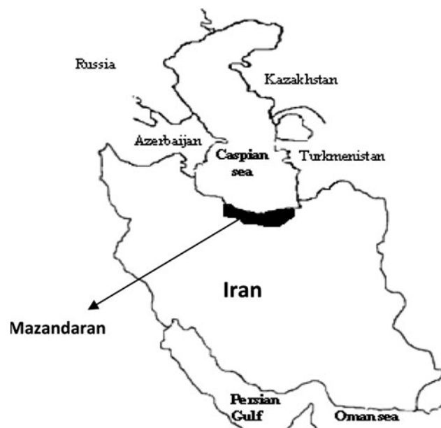
Fig. 1 Sampling sites for Gulls along the South coast of the Caspian Sea

Mercury was measured by the LECO AMA 254 Advanced Mercury Analyzer (USA) according to ASTM, standard No. D-6722. The LECO AMA 254 is a unique Atomic Absorption (AAS) that is specifically designed to determine total Mercury content in various solids and certain liquids without sample pre-treatment or sample pre-