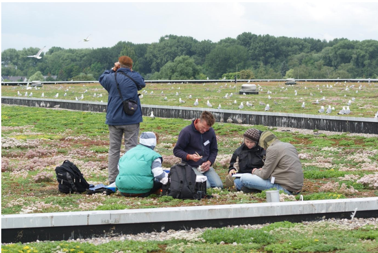
Our team at work – see the Belgian ringing tube in the authors hand.

Still we are missing up to hundred pairs of Mediterranean Gull, at least 60 per cent of them colour-ringed. We are very thankful for observations that we did receive from colonies in Europe yet, though it does not seem that we can trace the way the majority of our missing beauties went.