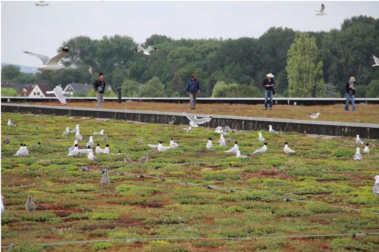
Counting nests, see the main cluster of Med Gulls on the top.

Also we found Lapwing (5/0), Oystercatcher (1/0) and Little Ringed Plover (1/0) breeding.