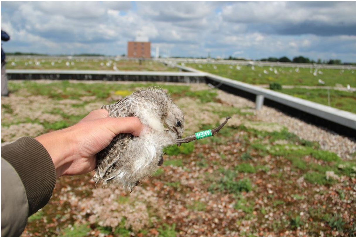
Non-fledged Larus melanocephalus AKEH practices for europe's observers.

29 juvenile Mediterranean Gulls have been colour-ringed on July 1st - we will continue to do research on these birds now fitted with the series AKxx and are looking forward hearing from you: