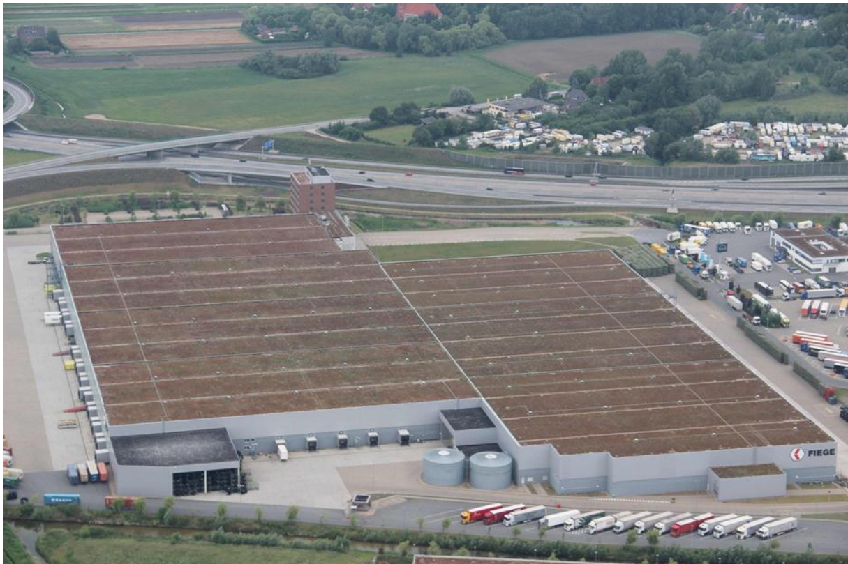
Picture of flat roof in Hamburg-Moorfleet taken from the airplane by Simon Hinrichs.

At the end of May 2011 some members of Hamburg study group (“Arbeitskreis”) entered a Cessna 172 for a flight over the central eastern part of the town. On the flight they managed to take photos of flat roofs that looked suspicious because of gulls in the air and on the buildings. Back home at the desk the number of birds has been counted, one photo offered approx. 900 Common Gulls.